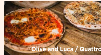
Olive and Luca / Quattro

OR KNAFEH/spun pastry, cashew cheese, orange blossom, pistachio, rose V GF